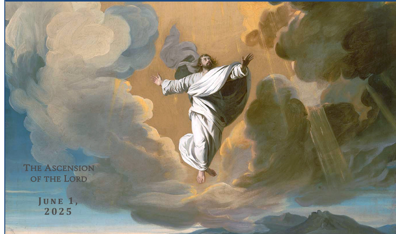
THE ASCENSION OF THE LORD