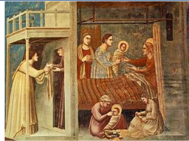
THE BIRTH OF THE BLESSED VIRGIN MARY

Cover Picture: Watercolour of the Cathedral, Holy Rosary Cathedral © 2018